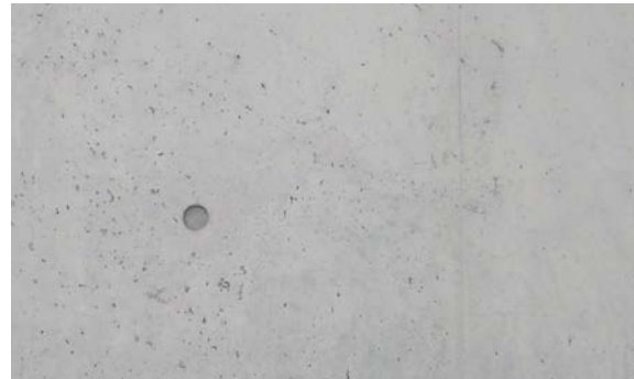
Uniform, mineral surface with KEIM Concretal-Lasur