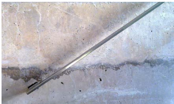
New concrete with defects that need to be refilled