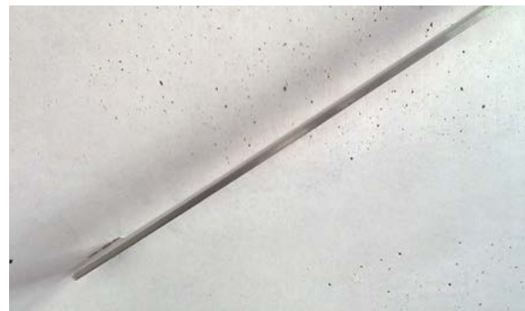
Refilled areas either strongly equalised or complete colour-matched mineral finish / © Arbeitsgemeinschaft Betonlasur