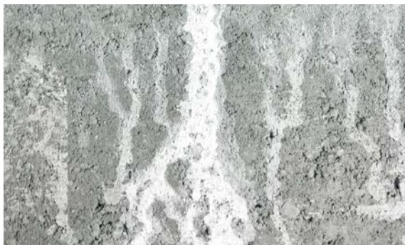
New concrete with severe blemishes