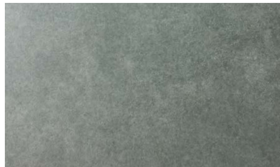
Blemishes either strongly equalised or complete colour-matched mineral finish