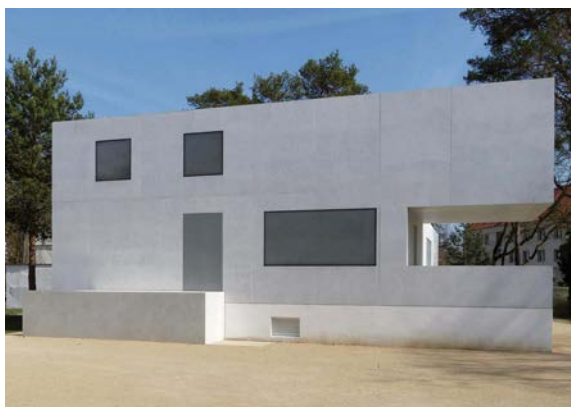
New Masters' Houses in Dessau; Architecture: Bruno Fioretti Marquez Architects; performance: Arbeitsgemeinschaft Betonlasur Berlin