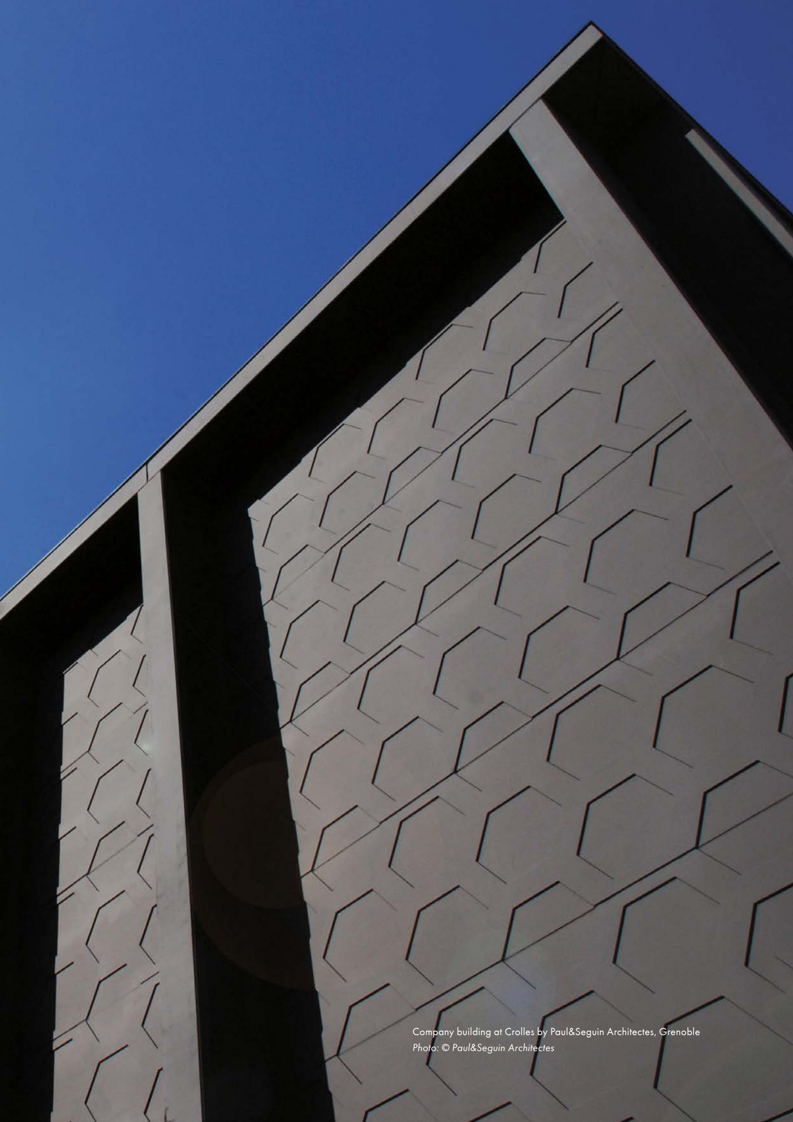
Company building at Crolles by Paul&Seguin Architectes, Grenoble