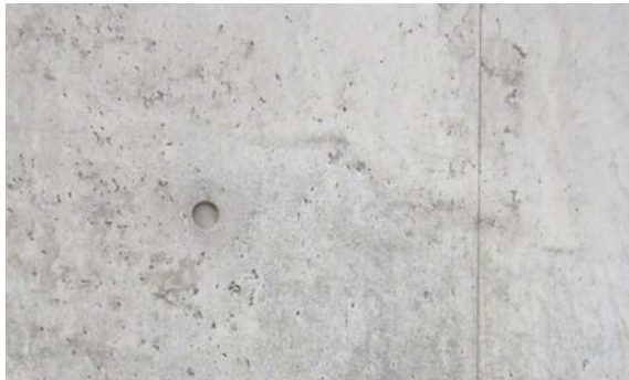
New concrete with slight blemishes